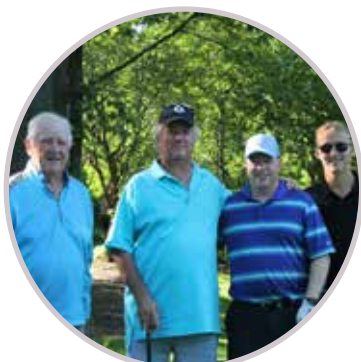
Men's Team Winners

The 27th Annual Kennedy Golf Invitational took place Monday August 22, 2016 at the beautiful Crystal Tree Golf & County Club in Orland Park, sponsored by Lexus of Orland and Shirey Cadillac.