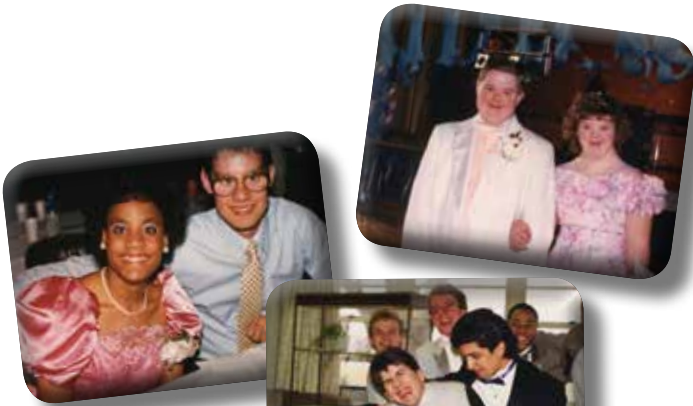
Dressed to the nine's for prom!

As the children, aides and teachers get settled into the new school year, lets take a step back and take a look at the Kennedy School through the years. Some of these smiling faces you will still see roaming the hallways of St. Coletta's today working in the workshop or participating in one of our vocational training programs.