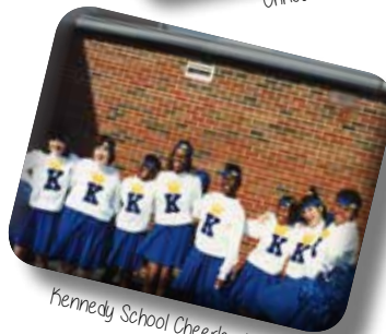
Kennedy School Cheerleaders