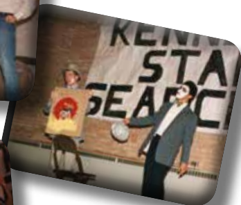
The search for the next Star at the "Kennedy Star Search"