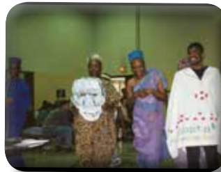
Black History month play