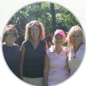
Women's Team Winners